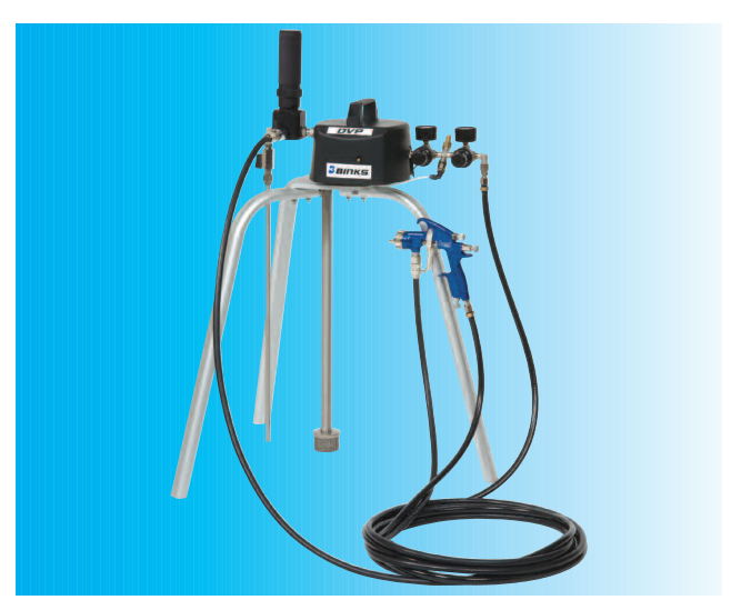
DVPAN-T-COMP: Tripod-mounted waterborne pump, fluid filter/ bypass assembly, twin air regulators, 7.5m air and fluid hoses, stainless steel pick up tube and filter and Compact Trans-Tech® Spray Gun*

DVP-T-FLG5 Tripod mounted pump outfit with FLG5 gun DVP-C-FLG5 Cart mounted pump outfit with FLG5 gun DVPAN-T-COMP Tripod mounted pump outfit with Compact gun DVPAN-C-COMP Cart mounted pump outfit with Compact gun