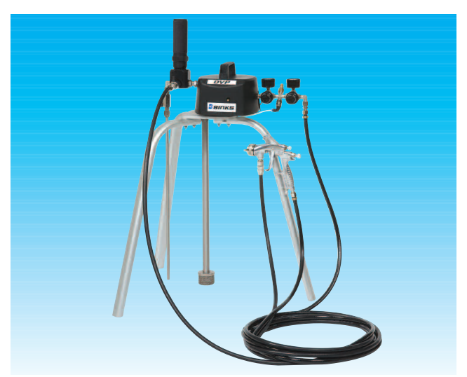
DVP-T-FLG5: Tripod-mounted standard pump, fluid filter/bypass assembly, twin air regulators, 7.5m air and fluid hose, stainless steel pick up tube and filter and FLG5 Conventional Spray Gun†

The DVP spray outfits are available with either Compact Trans-Tech® or FLG5 Trans-Tech® spray guns. They are delivered fully complete and ready to use apart from connecting the guns and hoses as necessary.