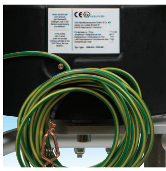
CE and ATEX approved with earthing cable as standard.