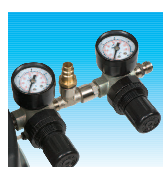
Twin air regulators provide independent control of the pump and spray gun pressures.