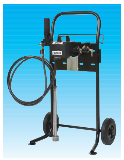
DVP-675 cart mounted standard pump