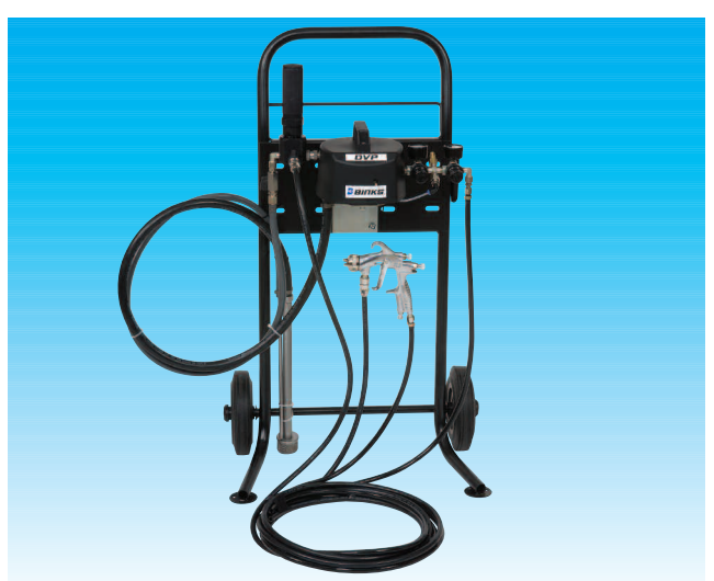
DVP-C-FLG5: Cart-mounted standard pump, fluid filter/bypass assembly, twin air regulators, 7.5m air and fluid hose, flexible suction wand and FLG5 Conventional Spray Gun†