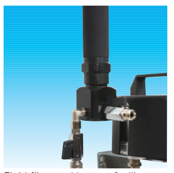
Fluid filter and bypass facility on all pumps.