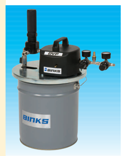
DVP-610-F pail mounted 25 litre standard pump. *Pail not included