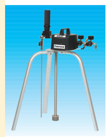
DVP-660 tripod mounted standard pump

Outfits include as standard, twin air regulators which independently control the pump and spray gun pressures, plus, an outlet fluid filter/bypass pressure dump assembly along with a flexible suction wand/filter assembly or a rigid inlet tube with filter to provide clean and filtered fluid to the spray gun. The fluid/material container can be constantly topped up whilst the pump is in operation, enabling all of the spray material to be used without waste, reducing downtime and assisting in quick and simple colour change operations.