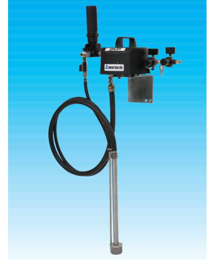
DVP-630-F wall mounted standard pump