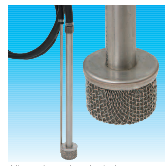
All suction tubes include stainless steel fluid strainers.